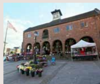
Ross-on-Wye Historic market town known as the "Gateway to the Wye Valley", with a 17th century Market House at its heart, offering quirky shops and activities nearby.