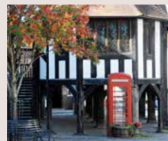
Newent A charming town, the 17th century Market House is surrounded by 13th century black and white buildings, independent shops and has attractions nearby.