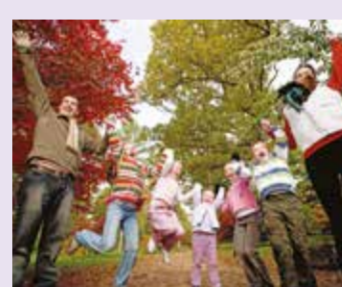
Westonbirt Arboretum One of the finest tree collections in the world, including a walkway through the tree tops offering spectacular views across the picturesque landscape.