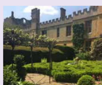
Sudeley Castle With Royal connections spanning 1000 years, Sudeley Castle and Gardens has stunning scenery, exhibitions and gardens to explore.