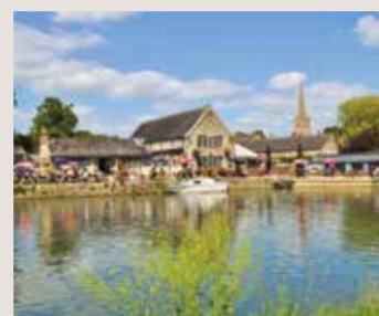
Lechlade Attractive town, located on the River Thames, with thriving market square full of interesting shops and cafés.