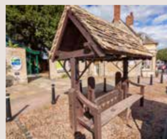
Woodstock A fine Georgian town with royal heritage, the many attractive period buildings include two museums and the town hall.