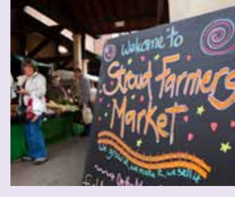
Stroud Farmers' Market Located in the heart of Stroud, browse the stalls selling local produce and talk with producers at this multi award-winning large popular farmers' market.