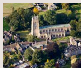
Winchcombe Beautiful market town with timbered inns, a castle, and quality shops, set in stunning countryside, offering beautiful walks.