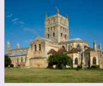
Tewkesbury Abbey Marvel at the history and architecture of this ancient abbey located in Medieval Tewkesbury.