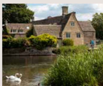
Fairford The riverside town's wool church has a complete set of 28 Medieval stained glass windows. Great base for the Cotswold Water Park area.