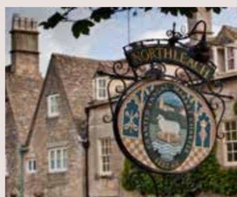
Northleach The ancient market place and streets are rich in architectural interest from half-timbered Tudor houses, to the Old Prison.