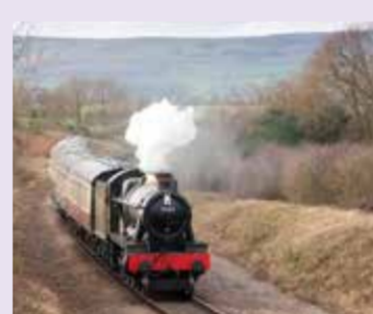
Gloucestershire Warwickshire Railway Travel in style on a steam train along the 29 mile round trip from Broadway to Cheltenham Racecourse with fantastic views.