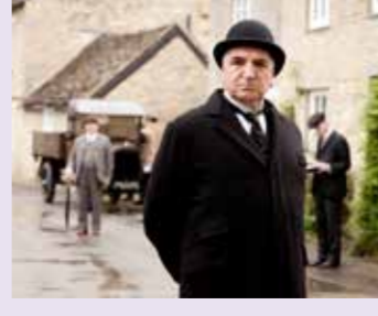
Film Locations Why not visit the locations of films such as Star Wars or Harry Potter, or TV series such as Downton Abbey, Poldark or Wolf Hall, you may even spot a film crew!