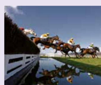
Cheltenham Racecourse Cheltenham Racecourse is the jewel in racing's crown. The racing, setting, tradition and finest hospitality all combine to give everyone an experience they'll never forget.