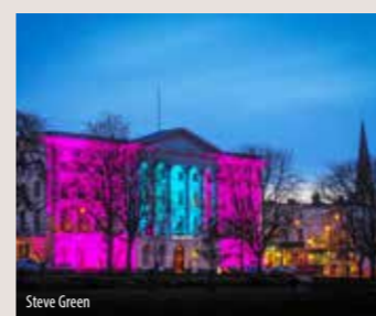
Cheltenham Refined elegance and Regency architecture provide the backdrop for fantastic festivals, enviable foodie scene and buzzing nightlife.