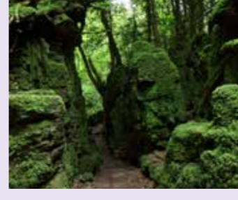
Puzzlewood An enchanting, ancient woodland filled with fantastic tree and rock formations. A popular TV & film location, credits include Star Wars.