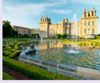
Blenheim Palace One of England's finest houses and a World Heritage Site, Blenheim Palace is the birthplace of Sir Winston Churchill and home to the 12th Duke of Marlborough.