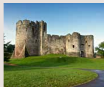
Chepstow The border town has an impressive castle, quaint streets to explore and the Forest of Dean over the Wales/England border, via the Old Wye Bridge.