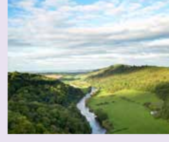
Symonds Yat An internationally renowned viewpoint, from the Rock watch peregrine falcons soar above the River Wye 120m below, or enjoy a drink in a riverside pub.