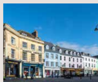
Cirencester Capital town of the Cotswolds, rich with Roman history and vibrant market square with fascinating parish church.