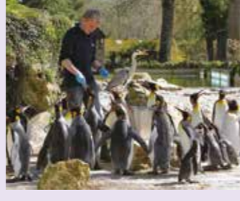
Birdland Explore the riverside gardens to discover exotic and rare birds from around the world including King penguins, pelicans and colourful parrots.