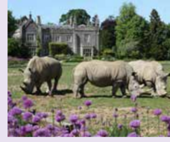
Cotswold Wildlife Park A memorable experience with 260 species of amazing animals on show, set in 160 acres with beautiful gardens, manor house and even a train.