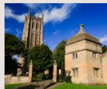
Chipping Campden Elegant town, full of distinctive well preserved buildings. Discover the Arts and Crafts movement in galleries and the museum.