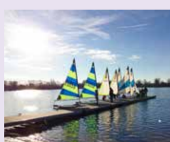
Cotswold Water Park Covering 40 square miles, the Cotswold Water Park has 150 lakes where all outdoor needs are catered for, from peaceful nature reserves to water sports and even rally driving.