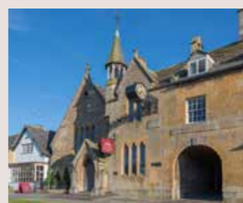
Broadway Broadway has strong links to the Arts & Crafts movement and a stunning, long high street full of independent shops, galleries and cafés.