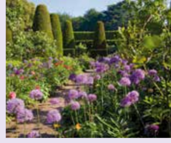
Hidcote Garden Hidcote is an Arts & Crafts garden full of colour and intricately designed outdoor 'rooms' that are full of surprises.