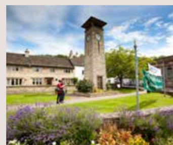
Nailsworth A lively, artistic market town nestled in a wooded valley, renowned for its selection of award-winning eateries and local vineyard.