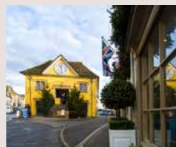
Tetbury Renowned for its Royal connections, this stunning town is full of architectural heritage including the iconic Market House.