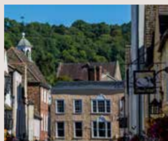
Wotton-under-Edge Located on the Cotswold Way the town has a great range of independent shops, and historic attractions nearby.