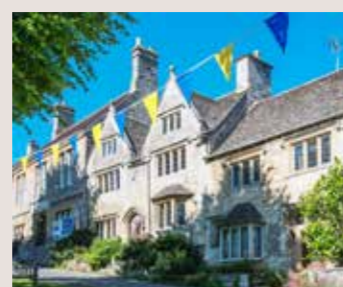
Burford A Medieval, historic high street, full of independent shops & cafés, sweeps down towards the River Windrush.

'Uncover the Cotswolds' enables visitors to combine must-see hotspots with little known, authentic treasures, places not mentioned in the tour guides or not normally open to the public. A wide range of experiences and suggested itineraries cover everything from the area's richly diverse heritage to the cultured Regency town of Cheltenham and the historic city of Gloucester: walks through stunning rural countryside, active adventures in the Forest of Dean or at the Cotswold Water Park; World Heritage Sites or fascinating local museums; the chance to take life slowly at a country spa; taste the fabulous local food; or pop in for a drink to meet the locals in the one of the many pubs in towns or villages that make the Cotswolds what it is today – ready to welcome you.