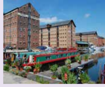
Gloucester Docks Old Victorian port with interesting views, shops and attractions including The National Waterways Museum.