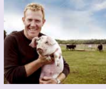
Cotswold Farm Park Home of rare breed conservation, Cotswold Farm Park offers a fun-filled day out where you can interact with the animals and learn about farming past and present.