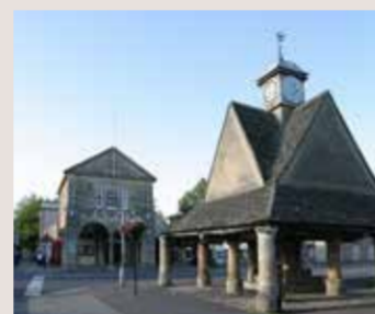
Witney A charming bustling market town with an excellent range of shops and a twice weekly market.