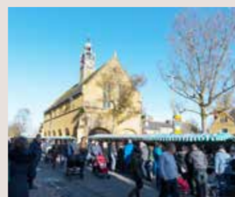
Moreton-in-Marsh The wide high street is lined with iconic Cotswold stone buildings along with a manor house, and on Tuesdays a retail market fills the centre.