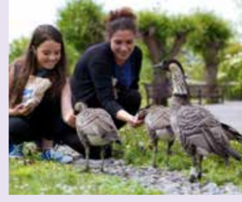
Slimbridge WWT Home to an astounding array of wildlife including the world's largest collection of swans, flamingos, geese and ducks - many migrating for the winter.